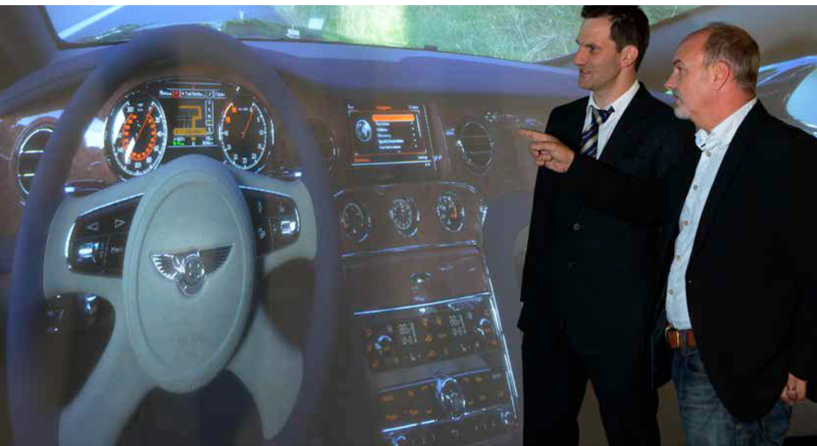
One of the visualisation suites at the Hartree Centre, Sci-Tech Daresbury.

To ensure that all aspects of our work support the overall Campus vision and that the synergies between the STFC “laboratory” role and our “Campus” role are fully realised, we will continue to promote and develop a series of Campus initiatives to act as portals for close collaboration between our facilities, academia and industry. One example is the Hartree Centre for Computational Science and Engineering that we established at Daresbury. This delivers real business solutions through high performance computing systems and has attracted significant resources from IBM who recognise the opportunities; this is described in more detail in section 4.2 below. Another example is our Business Incubator Programme. This has an impressive track record supporting innovative companies in their use of intellectual property arising from our research investments and since 2010 over 80 companies have benefited from this programme. At Harwell, we operate a highly successful business incubator for the European Space Agency – this nurtures small businesses to develop marketable services and products based on technologies with a space heritage. We have built on that success by working with CERN to launch the only CERN business incubator in the world at our Daresbury Campus. The first