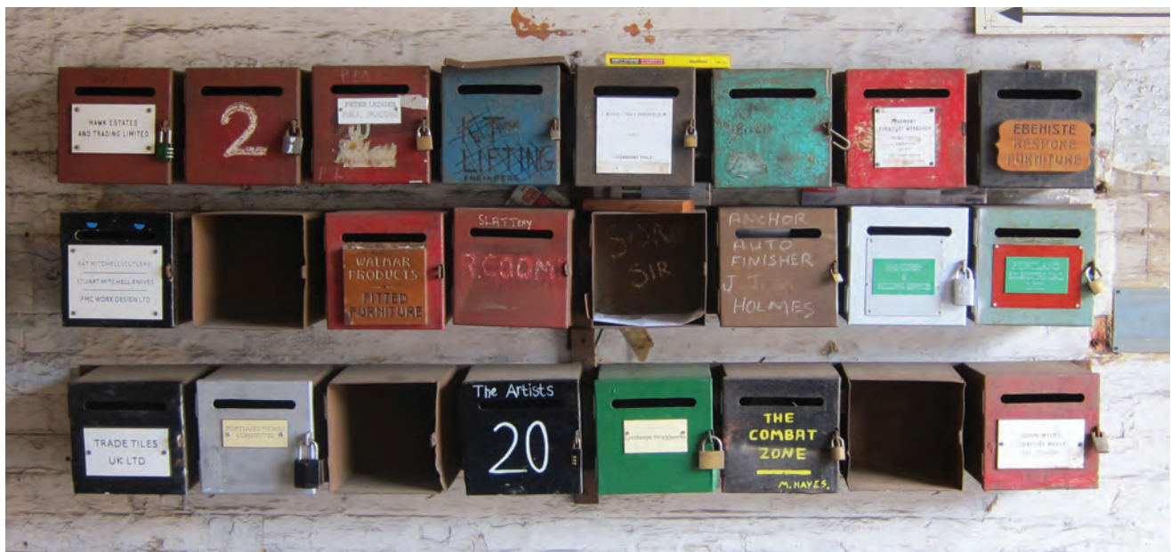
Below: The Stories of Change project is investigating energy – past, present and future. The 'Future Works' strand investigates energy and manufacturing across the English Midlands, including at Portland Works, Sheffield, the location of these postboxes.

Two different evaluations of art-in-prisons initiatives, carried out within three years of each other, provide an insight into